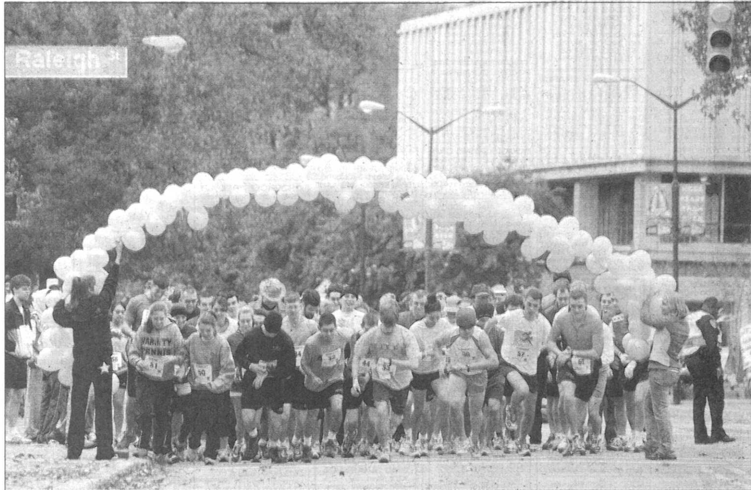
The Yellow Ribbon 5K run got under way at the intersection of South Road and Raleigh Street on Saturday morning. About 250 people participated in the event, the first such race to be held outside the Washington area.